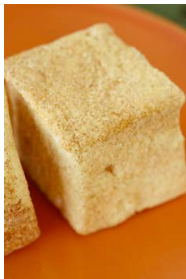
Jumbo cinnamon marshmallows from 240Sweet.

Home This Month's Issue Top Picks Product Reviews Blog Videos Glossaries Contests & Fun The Nibble Gourmet Market