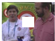
Marshmallow Shooter Review