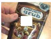
Classic Game Room - S'MORES GAMER GRUB Review